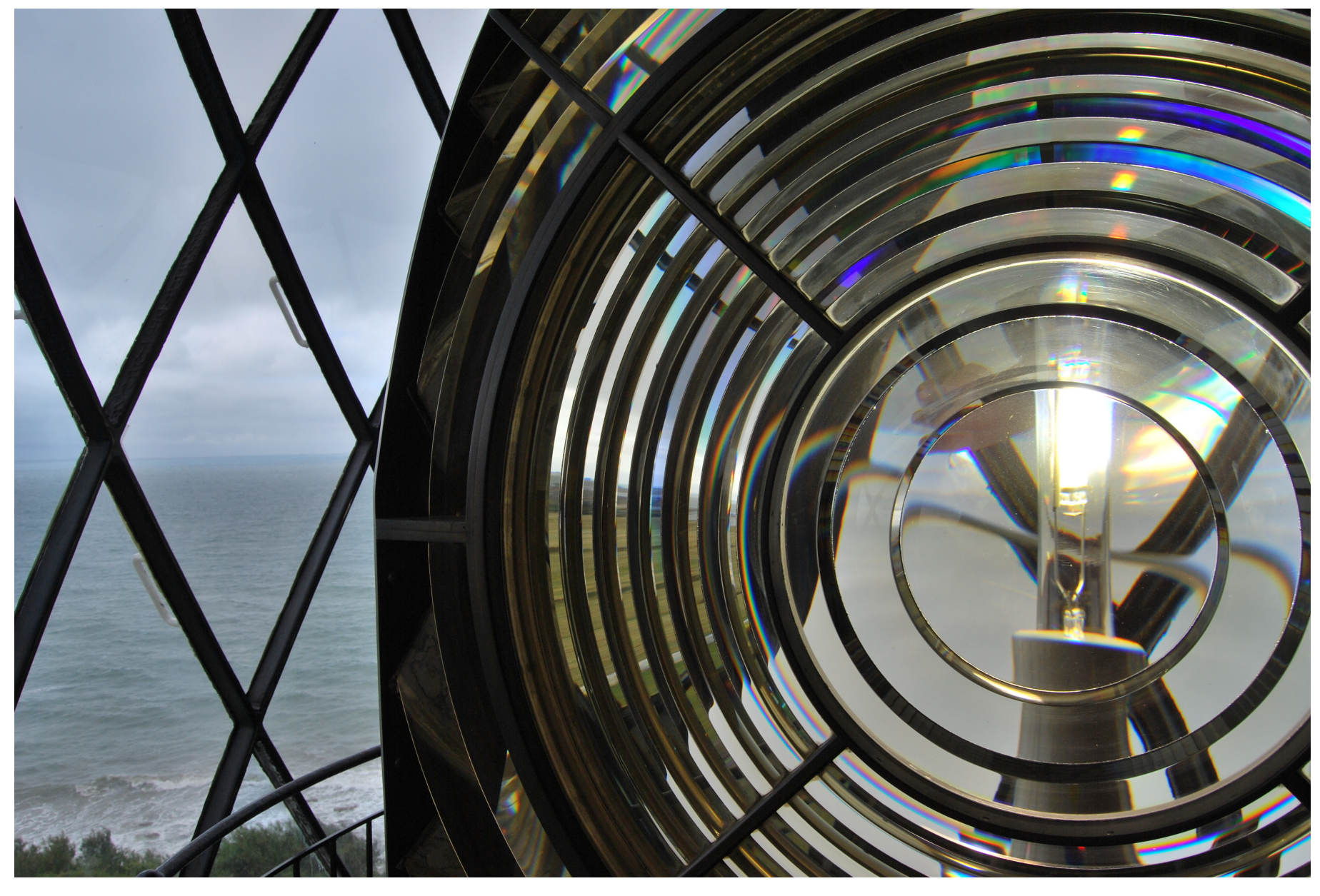
The light in situ in the tower of St Catherine's Lighthouse

The Classic Boat Museum is now custodian of this unusual piece of Island history - the Fresnel Lens from St Catherine's Lighthouse. The lens had been signalling the way for sailors travelling off the south coast of the Island for more than one hundred years. The lens was decommissioned in 2021.